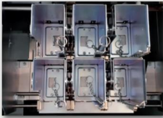
6x150 cards input hoppers