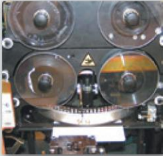
Embossing & Infill units