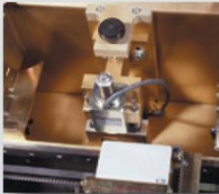
Widia stylus micro percussion

Logo + text 18 characters Font arial 18 - 1 row Standard quality 133 s. Draft quality 80 s.