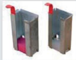
Medical alert tags & dog tags