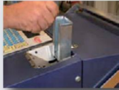
Interchangeable input hoppers for dog tags and medical alert tags for easy change