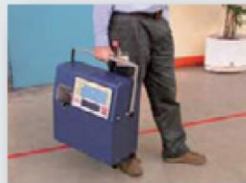
Easy to carry handle