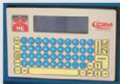
Integrated standard keyboard