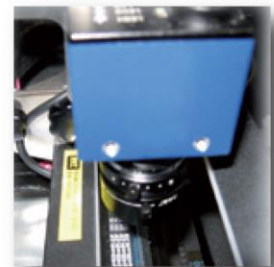
Built in vision inspection and verification system