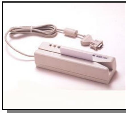
Model: MSR 206 Wedge swipe reader / encoder with software

Height: 1.23 in (31mm) Width: 1.28 in (32mm) Length: 3.94 in (100mm)