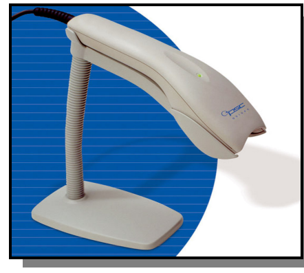
Model: Quick Scan 1000 Hand held barcode scanner with stand. Keyboard emulation

Light source: Visible Laser Diode(VLD) Scan system: Electromagnetic dithering mirror Rates: 42 scans/sec (nominal)