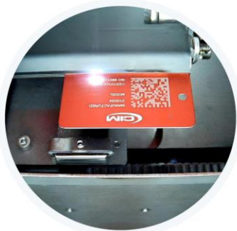
VIEW FROM THE INTERNAL CAMERA

IRON Systems feature a built-in 7-inch WVGA LCD touchscreen display for easy setting and monitoring . Users can easily access and configure the machine through a multi-level menu , making metal plate laser marking functions simple and intuitive to set up and use.