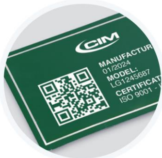
LASERED METAL PLATE

An internal view camera, managed by the software, allows live monitoring of the marking area, facilitating tuning , such as verifying the alignment of the metal plate, ensuring the proper functioning of the laser, and performing adjustments. The camera also enables shooting a picture of each marked tag that can be stored or shared.