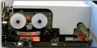
Embossing and infill